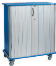
Front Sliding Doors Closed