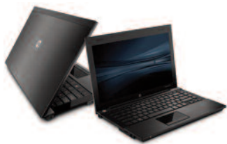
Charges 20x 15.4" notebooks