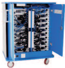
Back Doors Open