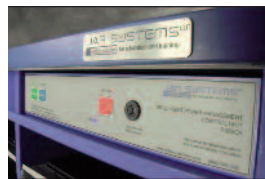
Intelligent Charging System