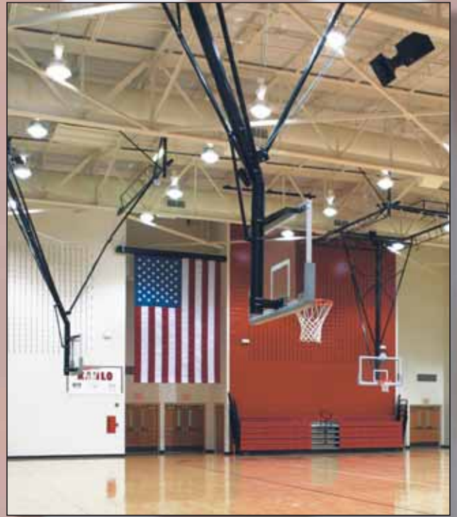
Patriot Motorized Flag at Knightstown, IN, High School. Architect: R.W. Clinton & Associates, Inc.

The Patriot can display a flag either vertically (500101) or horizontally (500102). Flag measures 12' x 18' with both mountings. The vertical or banner flag is housed in a 14'10" case, and the horizontal flag is housed in a 20'10" case. Custom sizes available.