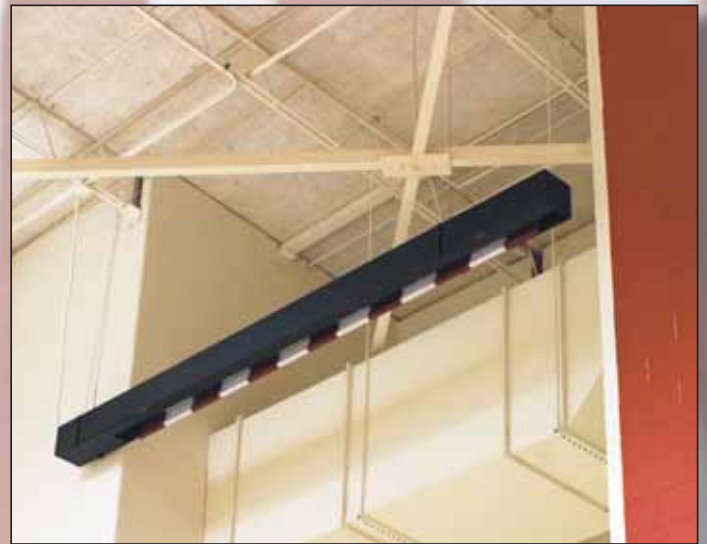
(Left) Close-up of flag mounting and case (above).